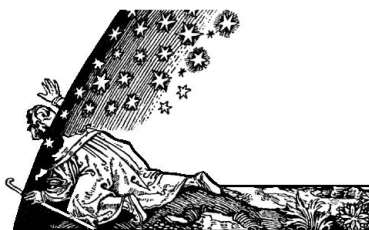
1: Text of the cap